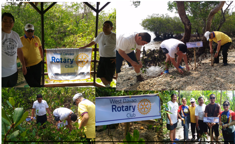
PHOTO GALLERY: One Rotary, One District Mangrove Planting 2019, Sept. 14, 2019

When Rotarians follow these easy steps, an entirely new opportunity for fellowship knocks each week. Soon, Rotarians realize that warm friendship is the cornerstone of every great Rotary Club.